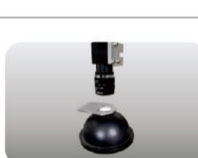
视觉定位系统 CCD fix system