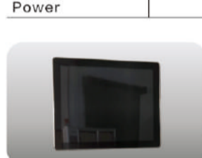
远程控制系统 Team viewer system