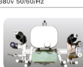
烫金系统 Hot-stamping system