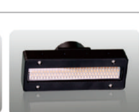
UV-LED系统 UV-LED system